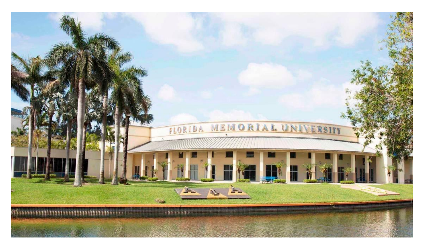
In compliance with the Jeanne Clery Disclosure of Campus Security Policy and Campus Crime Statistics Act